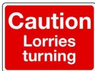
Plate 3-2: Example of Proposed Warning Signage for Public Highway

3.4.2 The appointed EPC Contractor(s) will ensure that all works within streets will have all required signage and traffic management measures in place to ensure the safety of workers and all other road users. These measures will be confirmed in the Final CTMP(s).